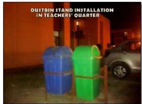
Segregating bin at teacher quarter

Team NWM has designed the stands for the installation of the segregating bins and get it fabricated. The stands were successfully installed in the different places of teacher quarter