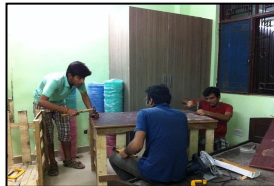
Compost bin making

It is the best method to turn your fruit, vegetable and yard trimmings into a very useful soil conditioner. With this objective in mind a compost bin was prepared by the NWM group members. Within three days of work of NWM students to prepare the compost bin.