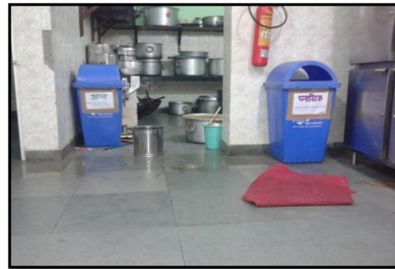
Dustbins placed in mess