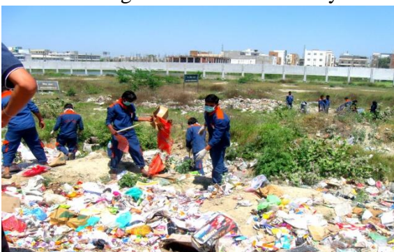
Workers segregating waste

A cleaning drive of waste disposal station was three times along with the housekeeping staffs and around 300 kg of waste has been recycled