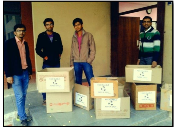
Paper collection by NWM group

Total 500 kg of paper was collected and planned to be recycled under the paper recycling plant proposed by NWM