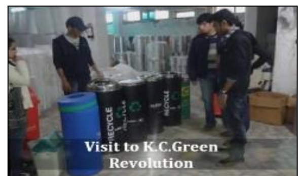
Visit to green dustbin supplier

Team NWM visited green revoltion Pvt.ltd to see the different types of dustbins available for waste segregation