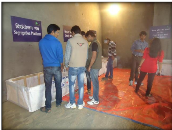
Segregating platform at pilot plant