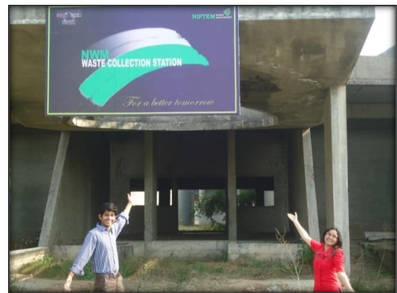
Waste collection station