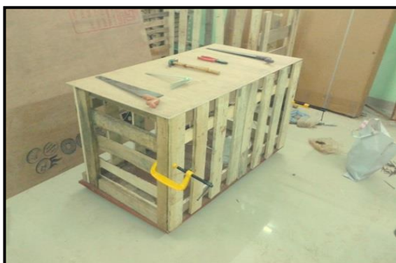
Prepared compost bin