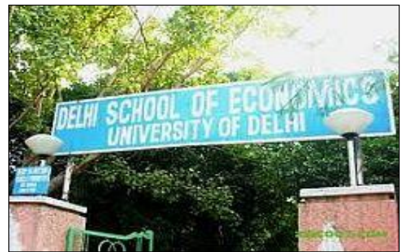
Visit to Delhi school of economics

Team NWM had visited Delhi school of economics to know about the procedure to avail carbon credit finance