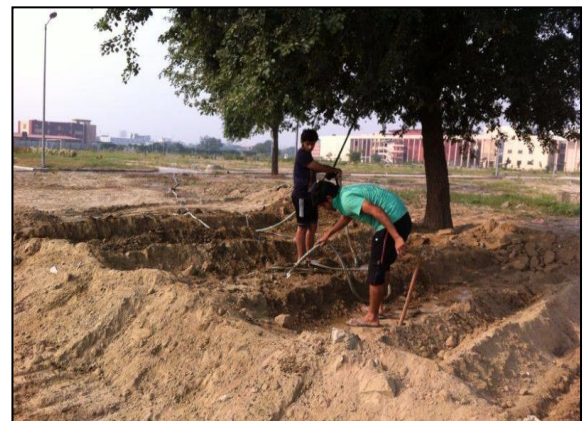
Preparing pits for vermi-compost

Team NWM initiated an activity of vermi compost making, suitable place and necessary requirement were made to initiate the activity of compost making. Continuous effort was made to complete this activity as of now 500 kg of vermi compost has been prepared and sold