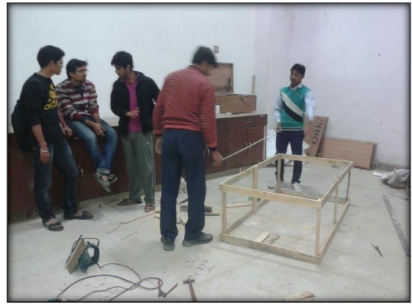
Bin preparation for segregation

In order to make the waste segregation challenge successful NWM group had made proper waste collection station, where the waste will be collected segregated and stored for proper waste management near pilot plant no. 4 for its further processing.