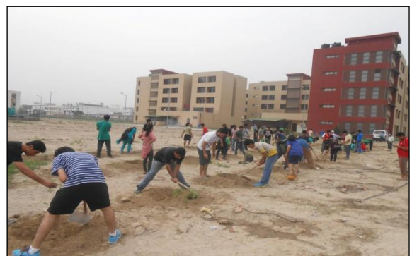
Plantation of trees by students

Team NWM along with the group members has initiated an activity of plantation and around 500 plants were planted