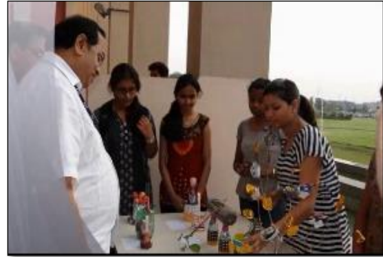
Best out of waste exhibition