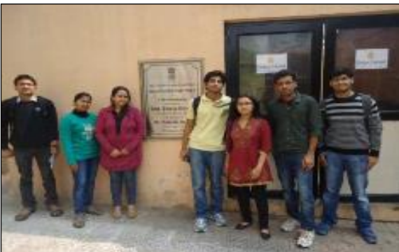
Visit to Delhi secretariat

Team NWM visited Delhi secretariats to see the on spot working of paper recycling unit and also the Nisargruna biogas unit which was planned to be installed in NIFTEM campus