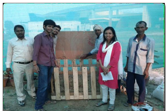
Demonstration of compost making