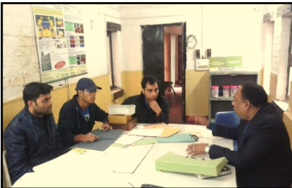
Students at Tara paper mak

Team NWM had visited Tara paper mak to know about the different equipments required to establish the paper recycling unit in NIFTEM