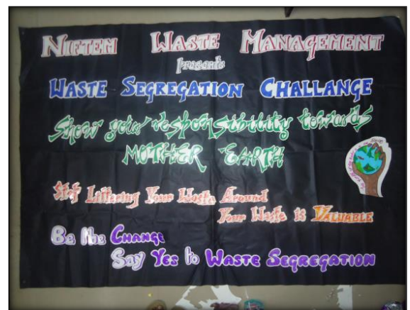
Poster prepared by team member